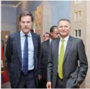
Dutch Prime Minister Visits Rawabi