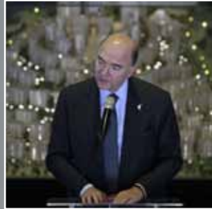
Rawabi Hosts French President Hollande's Ministers Delegation