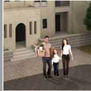
New Home Financing Reaches More Palestinian Families