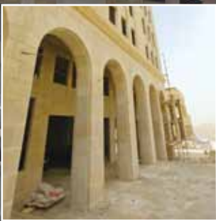
Rawabi City Center Promising Opportunities