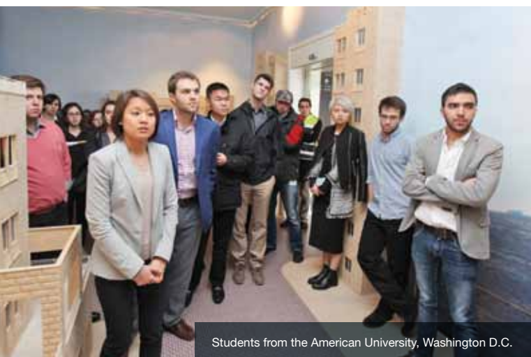
Students from the American University, Washington D.C.

Since ground was first broken in 2008, Rawabi has been seeking to bolster sustainable knowledge-economy projects and practices. To achieve this end, Rawabi has partnered with local and international educational institutions to include Harvard, Oxford, The Fletcher School of Law and Diplomacy at Tufts University, Columbia, Kellogg School of Management at Northwestern University, and Tuck School of Business at Dartmouth among others, in different fields such as urban