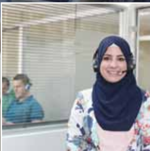
Rawabi's ICT Hub The Latest in Technology