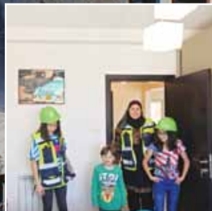
Model Homes WOW Prospective Homebuyers

Live, Work, and Grow in the first Palestinian planned city