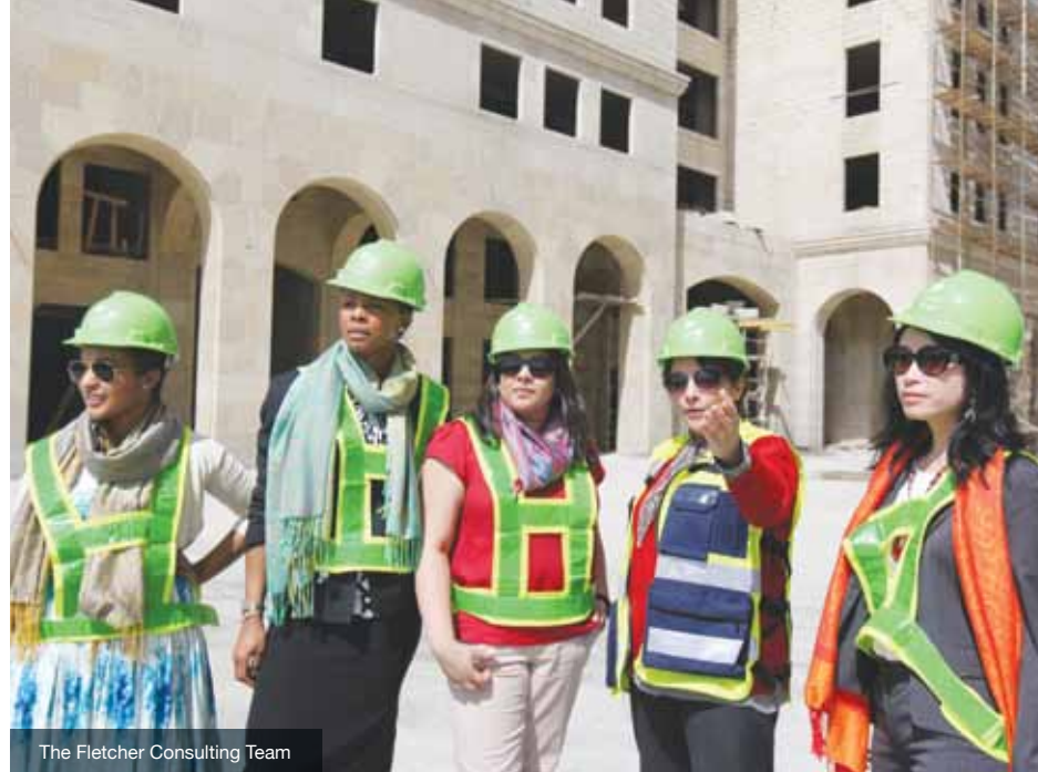
The Fletcher Consulting Team

The Fletcher School offers its Field Studies in Global Consulting course to enable students to work directly closely with sponsoring corporations and organizations to develop business solutions and to participate in the formulation of strategy and key decision-making processes.