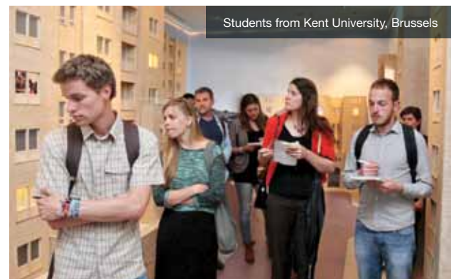
Students from Kent University, Brussels

development, urban planning, sustainable environmental studies and practices, business development and administration.