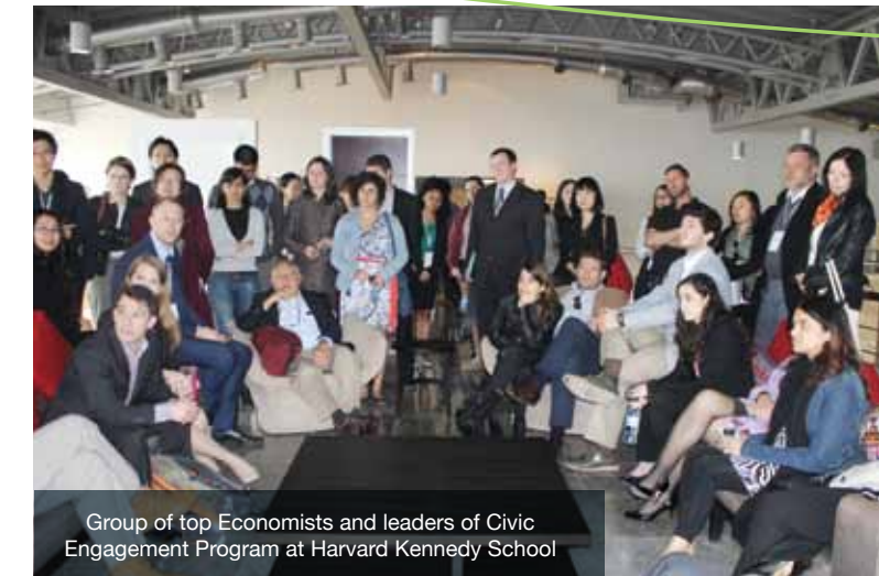
Group of top Economists and leaders of Civic Engagement Program at Harvard Kennedy School

to spur academic interest at both individual and institutional levels. Hosting consulting teams, organizing general lectures and presentations about Rawabi, inviting students and researchers to visit, study, and analyze the project from different aspects, and funding internships program are among Rawabi's activities to bolster knowledge-economy partnerships.