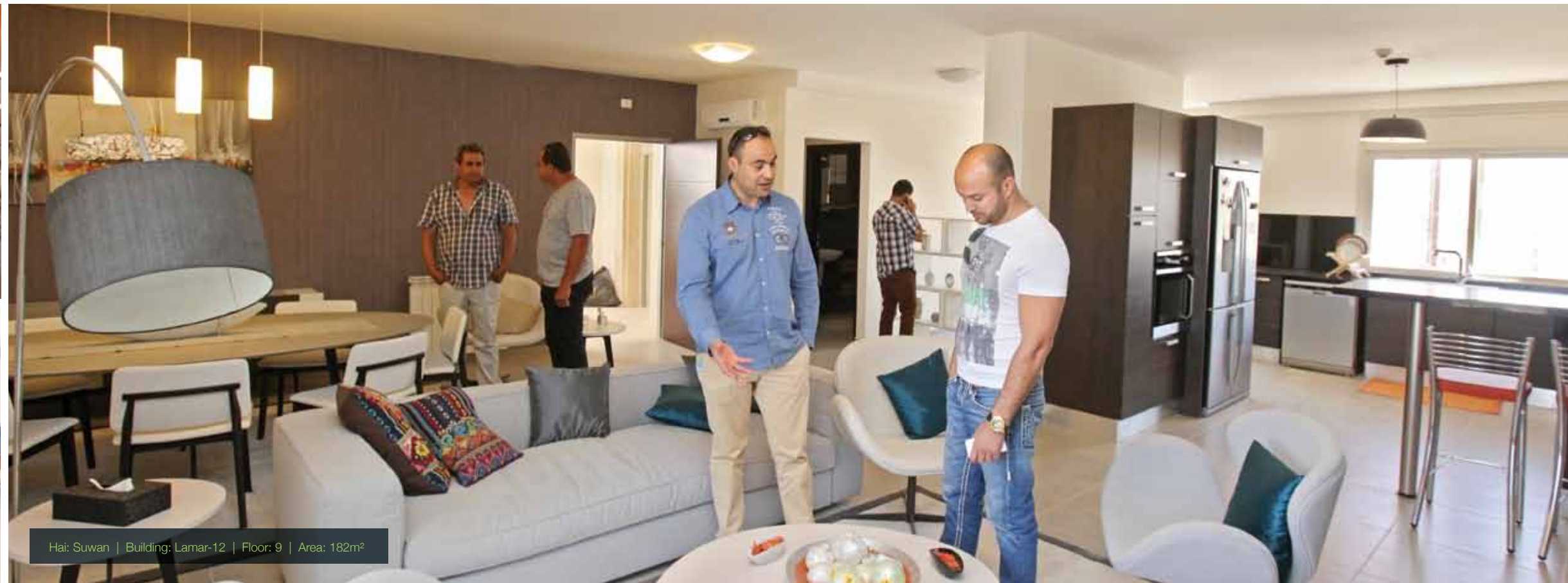
Hai: Suwan | Building: Lamar-12 | Floor: 9 | Area: 182m 2

Buying a home is a big decision that involves forethought, planning and imagining a new future for yourself and your family. To help prospective customers visualize life in a new Rawabi home, our architects and interior designers created fully furnished models with multiple layouts and varied décor. These beautifully presented homes exemplify the quality and workmanship found throughout the city of Rawabi, where every residence is a testament to the skill of Palestinian craftsmen.