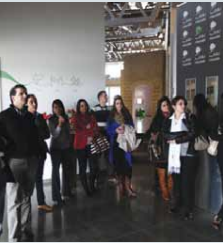
26 د.علي أبو زهري، وزير المواصلات Dr. Ali Abu Zuhri, Minister of Transportation