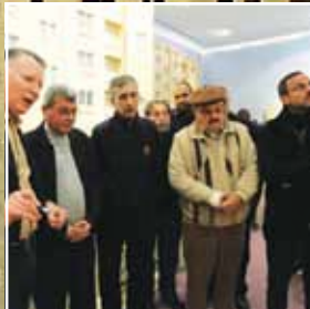
Former Prisoners Rawabi is a part of the equation of steadfastness in Palestine