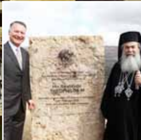
Jerusalem Patriarch lays the cornerstone of Rawabi's first church