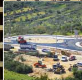
Rawabi's Main Roundabout.. to your right lies the magic of the city