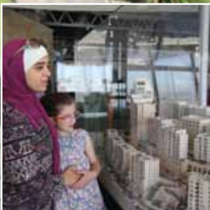
Rawabi: Right Here, Right Now