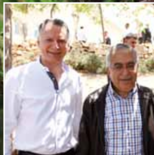
Fayyad: Rawabi Creates a New Reality on the Ground

Live, Work, and Grow in the first Palestinian planned city