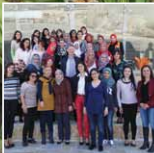
The Women of Rawabi