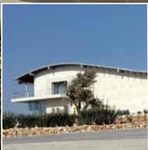
LIVE THE EXPERIENCE IN RAWABI'S SHOWROOM