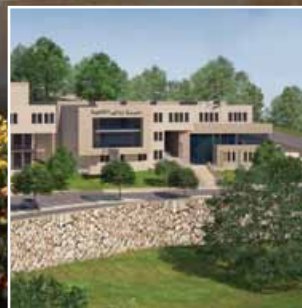
CONSTRUCTION OF SCHOOLS IS UNDERWAY