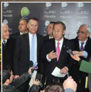
UN SECRETARY-GENERAL VISITS RAWABI