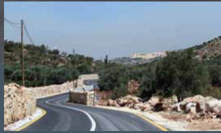
* Rawabi's access road.

Construction of the temporary access road to Rawabi is complete, significantly reducing driving time to Rawabi . The new road has cut drive times almost in half – you can travel from Birzeit to Rawabi in less than 5 minutes and from Ramallah to Rawabi in under 15 minutes.